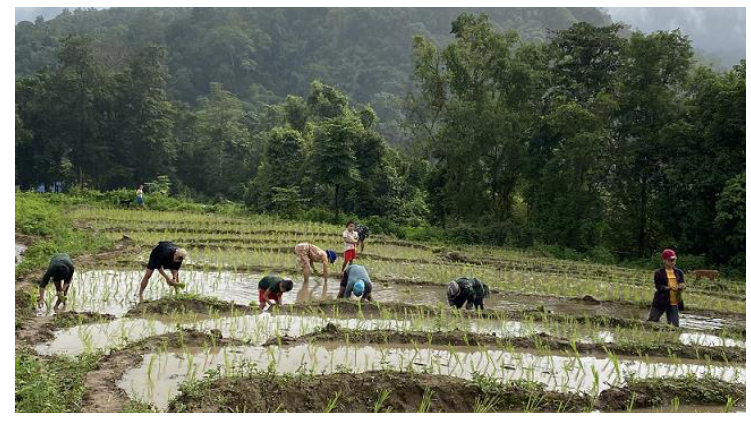
Irrigated rice (paddy) terraces

Since the 2012 KNU ceasefire (which effectively broke down in 2021), there are more roads in the township (particularly over the past four or five years - mostly dirt "motorbike roads), and also more trash (litter). Historically, the KNU has resisted road building as an avenue for Tatmadaw invasion and external resource extraction. Recently however, the KNU has acquired heavy machinery and engages in road building to suit the needs of local communities, such as marketing of local commodities and importation of needed goods from Thailand, as well as for better transportation of KNU officials.