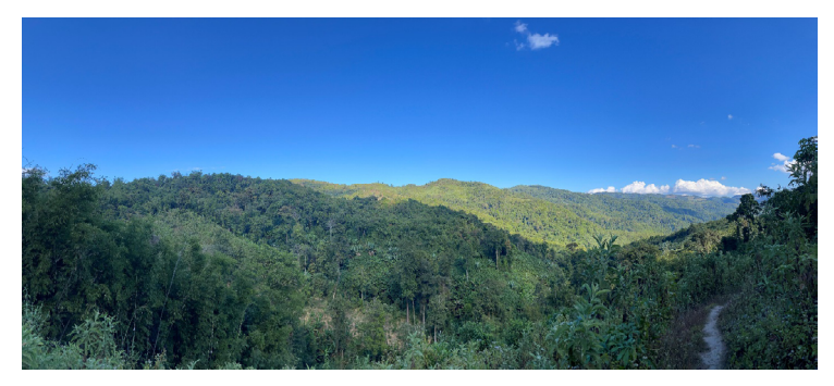
Variegated land-use - forest, bamboo and previous shifting agriculture (so-called "slash and burn") rice fields

Since the 2012 KNU ceasefire (which effectively broke down in 2021), there are more roads in the township (particularly over the past four or five years - mostly dirt "motorbike roads), and also more trash (litter). Historically, the KNU has resisted road building as an avenue for Tatmadaw invasion and external resource extraction. Recently however, the KNU has acquired heavy machinery and engages in road building to suit the needs of local communities, such as marketing of local commodities and importation of needed goods from Thailand, as well as for better transportation of KNU officials.