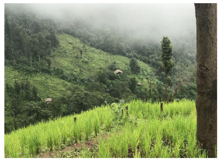
Shifting upland rice cultivation during rainy season

These local coping mechanisms overlap with traditional Karen customs of communal agriculture. Families take turns helping each other to prepare hillside swiddens for upland rice cultivation prior to the rainy season. (For an account of Karen shifting agriculture, see below). Such communal approaches are less common in relation to irrigated rice fields.