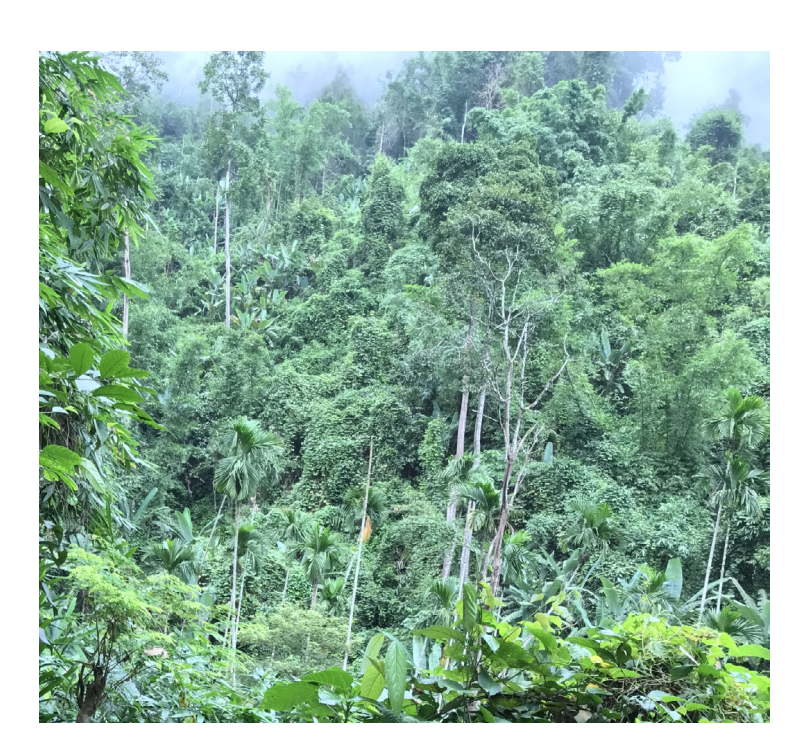
Perennial crops – betel nut, banana, durian, etc., mixed with bamboo and indigenous forest

A couple of key informants mentioned that the rainy season has become shorter in recent years, and the weather hotter (less cold in the winter). This is consistent with data provided by the previous government in Myanmar (see South and Demartini 2020). As a result, some villages are noticing slightly decreased yield for both irrigated and upland rice - and smaller grains. Farmers also say the longer dry seasons complicate the planting of perennial crops, such as fruit or coffee, which are beneficial for land conservation, and important to support adaptation initiatives. These impacts of climate change are likely to be exacerbated in the future.