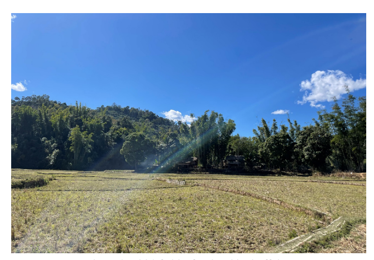
Organic irrigated rice (paddy) fields, fertilised by buffaloes

Many villages lack latrines or clean access to water. Few private households have latrines.